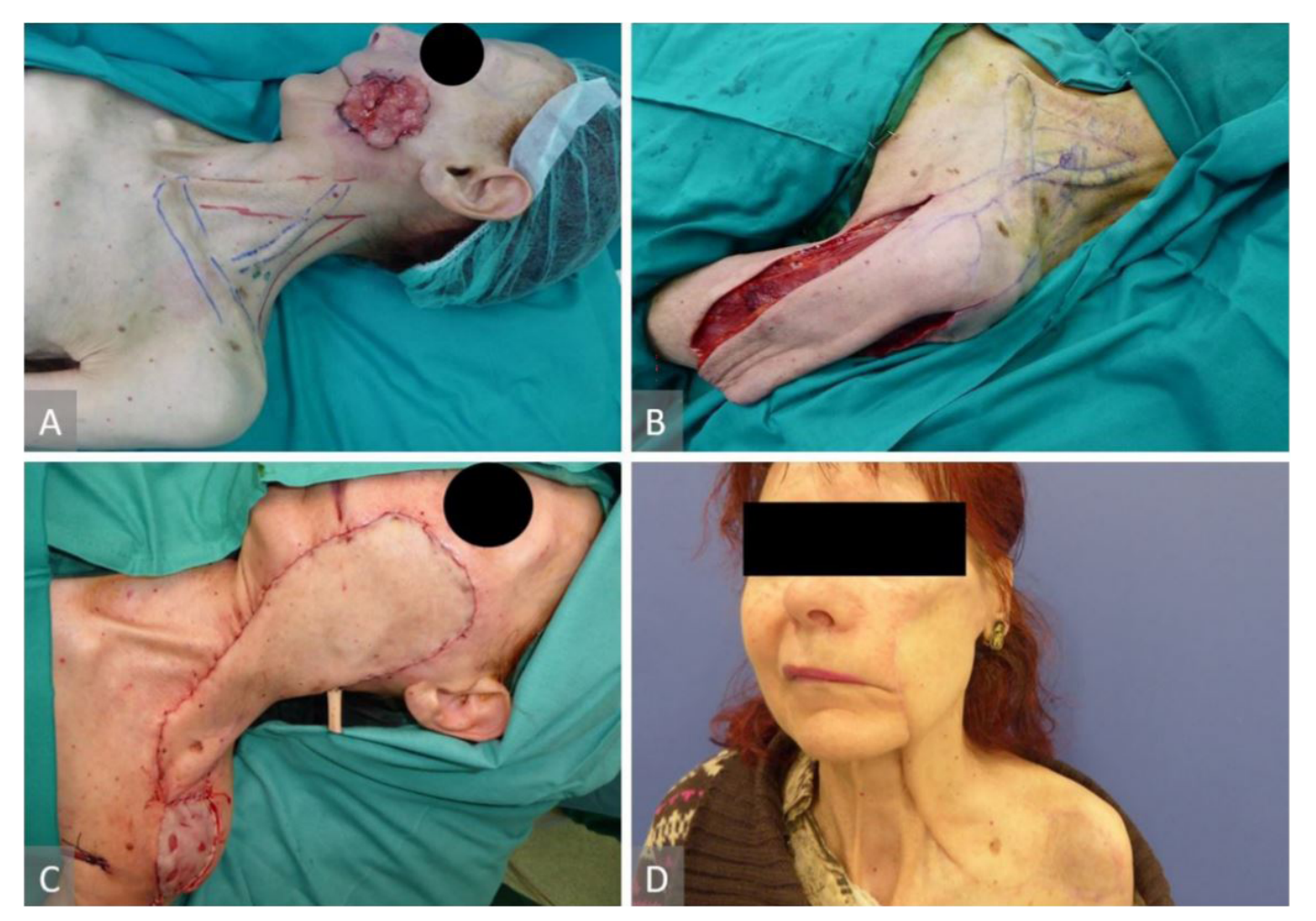
Figure 5. (A) Basal cell carcinoma in the left cheek. (B) Vascular pedicle marked and flap raised. (C) Flap inset and donor site closed with a split-thickness skin graft. (D) Six-month postoperative result.

From the literature review of supraclavicular flaps for head and neck reconstruction in PubMed search engine, 26 articles [1,2,4,11-17,19,20,23-26,28,29,31,33-40] were found that had used supraclavicular flaps for head and neck reconstruction and had clearly stated the length of flaps and their rate of necrosis (Table 2). The rate of necrosis varied according to the size of the flaps, and only a few of the published articles clearly associated the rate of necrosis with the definite length of the flaps.