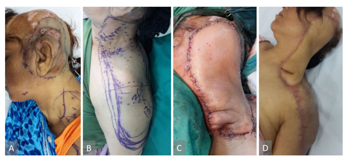
Figure 3. (A) Squamous cell carcinoma of the scalp and temple, involved left temporoparietal area and left auricle. (B) The supraclavicular flap of 30 X 11 cm marked to be delayed. (C) The flap inset. (D) Three-month postoperative view.

The results of this study have been analyzed to see the relationship between the flap length and distal end necrosis. According to the data obtained in the results section of this report, the distal end vascularity of the supraclavicular artery island flap was reliable up to 22 cm, but the flaps with the size of 23 cm and above increased the risk of distal necrosis, regardless of whether the modification procedures were performed or not. Due to the presence of modification procedures in 6 flaps above 23 cm length, the statistical analysis couldn't be reported without bias as the group of the flaps above 23 cm was nonhomogeneous.