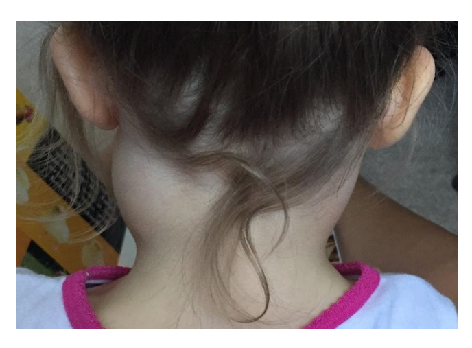
Figure 2. Image of massive lymphadenopathy of the patient mentioned in Case {\bf 3}.

Two weeks later, the redness and swelling of her LNs increased, which were drained and the specimen grew MSSA (Methicillin sensitive Staphylococcus Aureus) with no growth of mycobacterium or fungus. Once the antibiotic course was completed, bilateral modified neck dissection and LN resection were performed. The AFB smear and culture on the specimens were negative; the bacterial and fungal cultures were negative as well. Flow cytometry showed no immunophenotypic evidence of B or T cell non-Hodgkin lymphoma. Pathological findings showed acute lymphadenitis, necrotizing with prominent histiocytes accumulation, and neutrophilic micro-abscess formation. We suspected that the MSSA was a superinfection on an underlying process. In the recent 15-month follow-up, there was no evidence of recurrence.