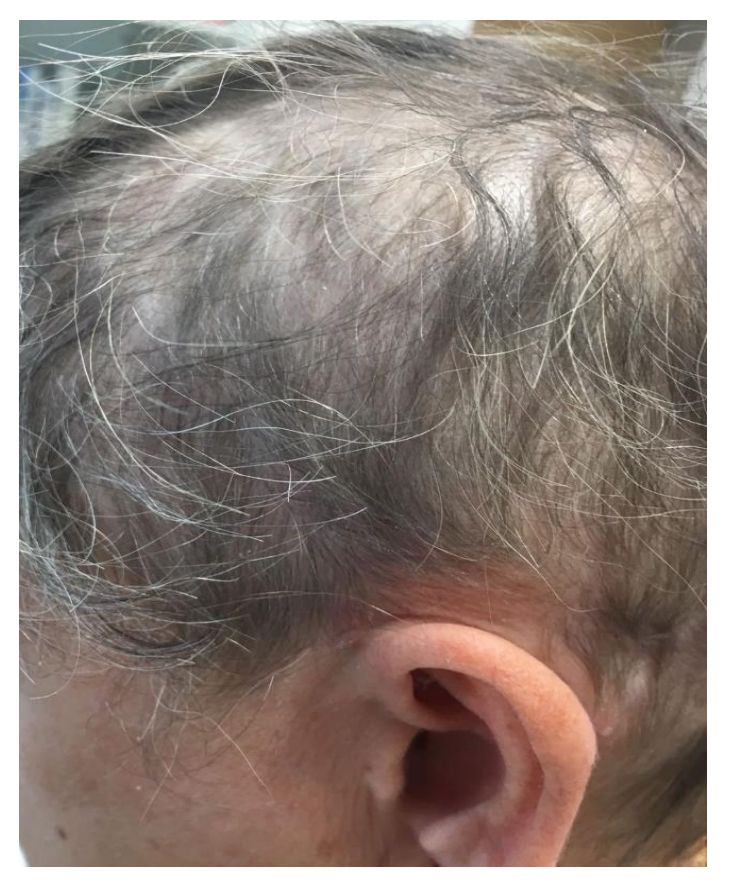
Figure 2. Significant scalp-hair regrowth after 6 weeks with Apremilast.

The patient developed diarrhea attributed to Apremilast since the first week, and subsequently weight loss (seven kilograms in 8 weeks). As the patient declined to stop the treatment, the drug use was continued, associating it with an oral antidiarrheal agent as loperamide and probiotics