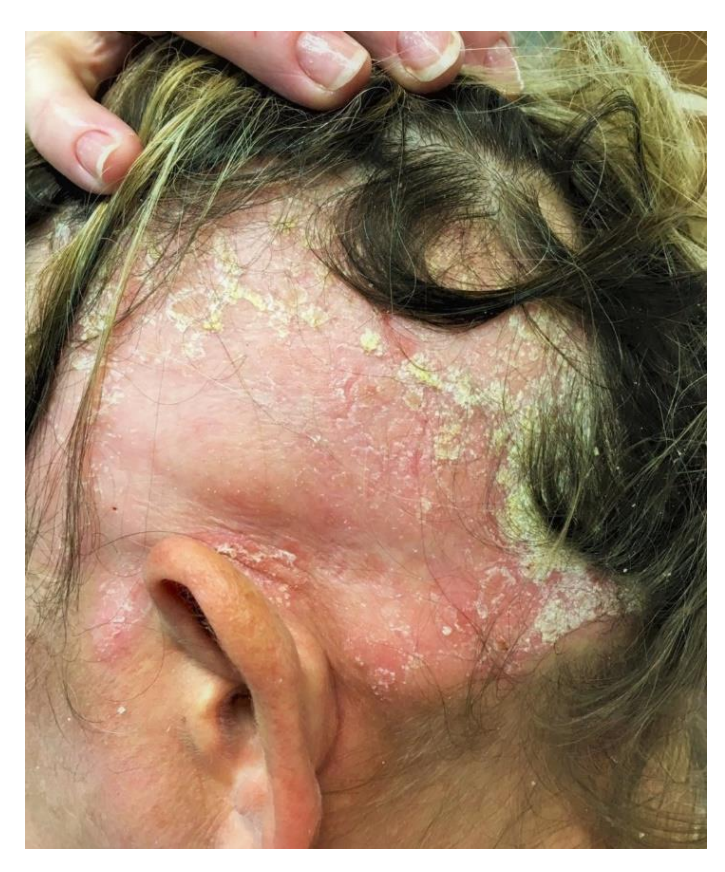
Figure 1. Ophiasic alopecia areata before treatment with Apremilast.

Treatment with Apremilast was started as label dosing, and after 6 weeks the patient showed significant improvement in psoriasis lesions with reduced erythema and scaling, and marked improvement of pruritus. Interestingly, significant hair regrowth was seen on the scalp (Fig. 2), and with the on-going Apremilast therapy, hair continued to grow until it achieved complete regrowth.