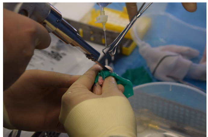
Figure 2. The rubber glove assisting good grip during osteotomy with an oscillating saw.