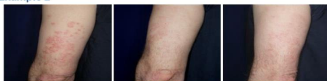
Figure 3. Example photographs of patients before and after the treatment with NTI528 topical cream.

In contrast to the role that the endogenous ligand-AhR plays in regulating autoimmunity, at interface organs such as the lung, gut, and skin, exogenous ligand exemplified as environmental pollutants- mediated AhR activation leads to an effector response [21]. At these locations, toxins or environmental pollutants binding to the AhR in immune cells lead to Th17 differentiation, thereby producing inflammatory response.