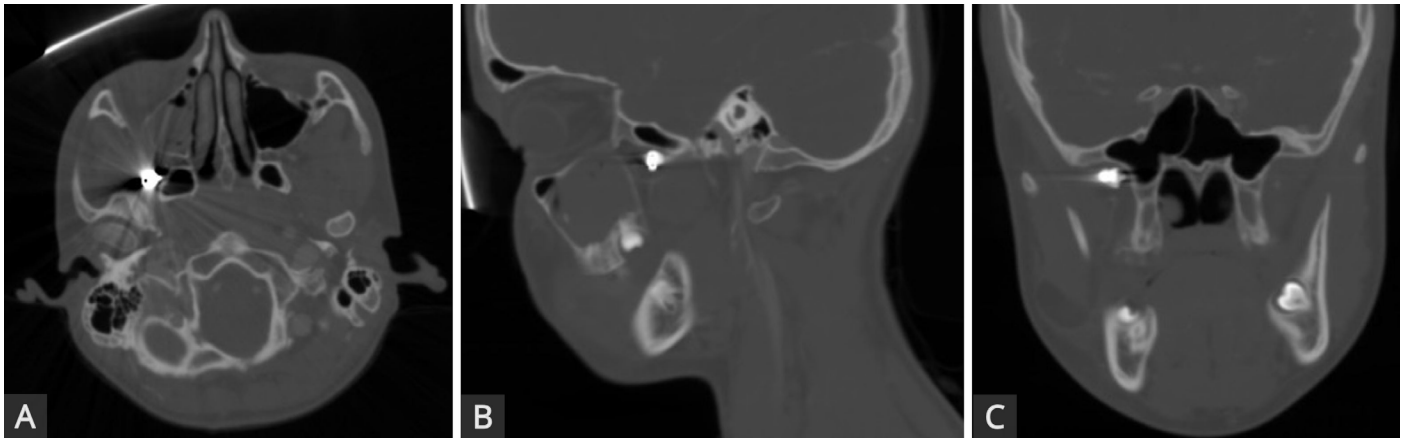
Figure 2. (A) Axial CT scan identifying the foreign body as an air gun pellet in the right pterygopalatine fossa. (B) Sagittal CT scan, transverse view showing that the pellet had penetrated the anterior and posterior wall of the right maxillary sinus with subsequent hematoma. (C) CT scan with a coronal view showing the pellet lodged in the pterygopalatine fossa. Note the minimal bone destruction and the proximity of the pellet to the lateral aspect of the sphenoid sinus.

Accordingly, the pellet was not initially surgically removed, and the patient received oral antibiotics without developing further complaints. Fifteen days after the initial trauma, the patient returned to our department with massive nasal bleeding, requiring anterior and posterior nasal packings. Angiography indicated an injury to the right maxillary artery. After embolization, surgical removal of the pellet was conducted via a right-sided transfacial transmaxillary approach to the PPF (Figure 3). The patient was hospitalized for five days without any further complications.