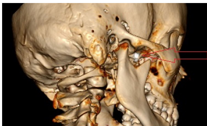
Figure 1. Three-dimensional reconstruction from a CT scan showing an air gun pellet in the pterygopalatine fossa (red arrow).

A 16-year-old male patient presented with a complaint of an air gun shot in the right side of his cheek caused by a bullet fired from an air gun with a long barrel. The weapon was fired within 30 cm of the patient's face. In the initial visit to our department, a minimal wound with a diameter of 1 mm and depth of 2 mm in the right cheek without inflammation or swelling was observed. At that time, the patient had no active bleeding. Computed tomography (CT) showed a foreign body located in the right pterygopalatine fossa (Figure 1 and 2). It was detected that the pellet penetrated through the anterior and posterior wall of the maxillary sinus without any noticeable injury to the blood vessels or nerve damage.