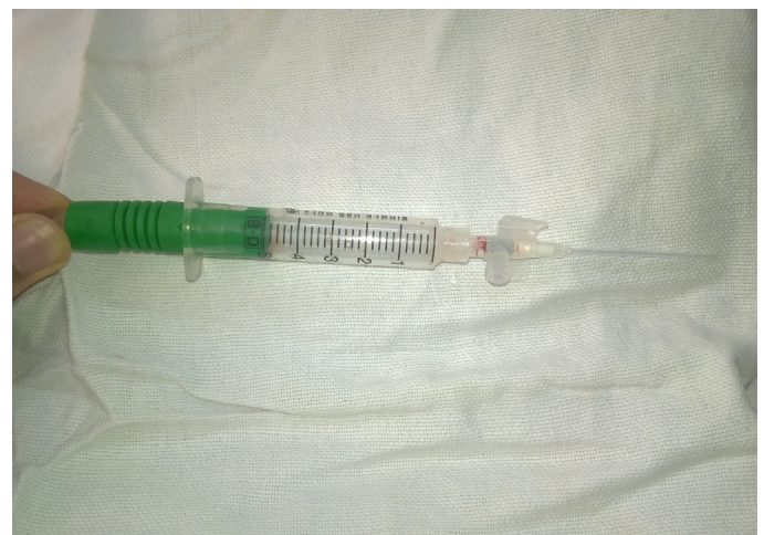
Figure 2. A microsuction cannula made from a syringe and an intravenous cannula.