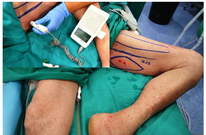
Figure 2. The measurements associated with the perforator and its branches are translated on to the patient. Locations of both branches are confirmed with a handheld doppler.

CTA allows quick and easy assessment of the whole vascular anatomy of the leg and helps to arrive at the decision about selection of the best flaps based on the characteristics of the defect and on the individual anatomy of the patient. CTA suffers from the limitations of use of contrast medium and exposure of radiation to the patient. It may also lead to inadequate findings related to insufficient contrast enhancement which does not distinguish between the thin fat layer leading to a confusion between arteries and veins. Some of these limitations can be overcome by a color doppler ultrasound be-