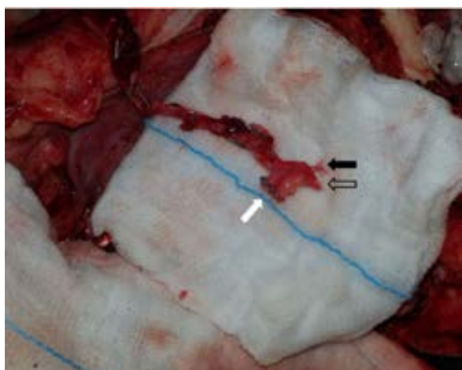
Figure 2. The solid black arrow indicates artery, the hollow black arrow indicates vein, and the white arrow indicates ligaclip applied over proximal tributary.

Sometimes (in anterolateral thigh and medial sural artery perforator flaps), the vena comitans join together to form a single larger vein which is easy to repair, and we dissect until anastomosis length of larger vein is achieved. In such circumstances, we usually dissect and keep a proximal branch of the vascular bundle for about a centimeter before the application of ligaclip. After arterial repair, we remove the ligaclip from the vein to allow this proximal tributary of the vein to drain freely in cut finger glove to reduce venous congestion (Figure 2).