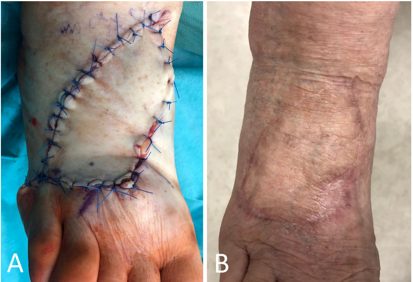
Figure 3. Type IIa keystone design perforator island flap technique for foot reconstruction. (A) Immediate post-operative outcomes. (B) One-year post-reconstruction results. Lower limb defects pose significant complexities in the realm of reconstruction, primarily due to limited vascularization and skin laxity. The findings of our study strongly underscore the dependable nature of the keystone design perforator island flap as an effective and practical solution, expanding its applicability to the realm of foot reconstruction.

achieving favorable outcomes and optimizing patient care.